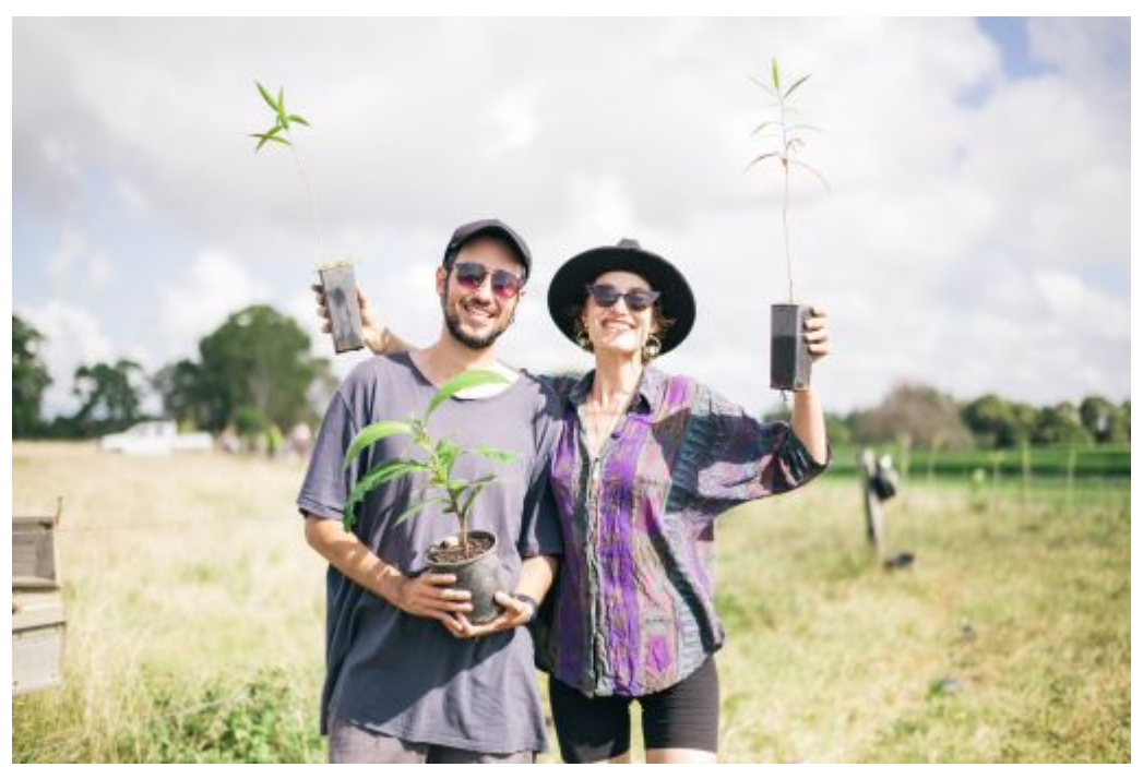
Environmental activities and sustainability-themed workshops are part of the program with the opportunity to participate in tree planting.

"We already host a variety of sustainability-themed workshops and give attendees the opportunity to participate in tree planting and revegetation efforts, but this year we're investigating how to have the festival formally accredited as 'carbon neutral'", Mr McMillan said.