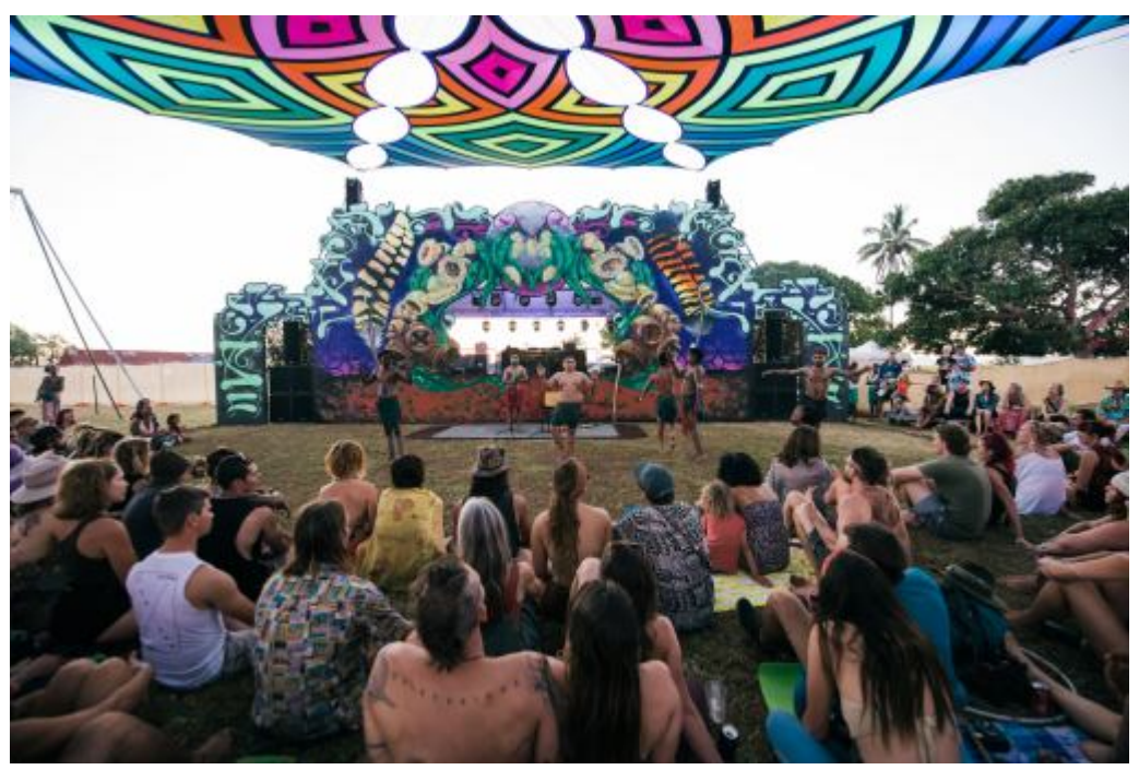
Local Indigenous dance groups performed for the crowd at last year's festival.

The three-day eco-conscious music, arts, education and land care festival moved from Woodleigh Station in Ravenshoe to Mungalla Station in 2021 and received rave reviews from festival attendees who embraced the Indigenous culture and land care activities that the new location provided.