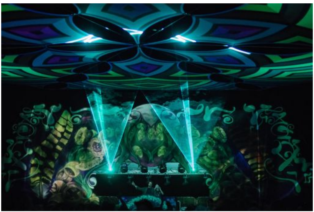
RootBound comes alive at night: A celebration of music, art, culture and conservation is at the heart of the festival.

World renowned beatboxer Tom Thum will headline the music program which covers a wide variety of genres, from hip-hop and drum and bass on Friday night, live bands and performances on Saturday and dance music on Sunday.